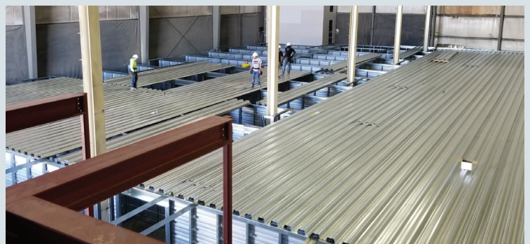
Trachte designs, engineers, fabricates and installs multi-story mezzanine systems

Control stays intact from shipment to completion.